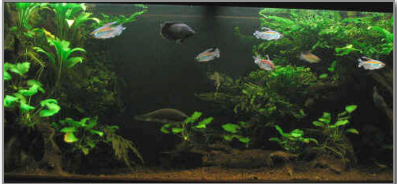
Travis fabulous Zaire River tank...

None of these aquatic worlds is “peaceful” either... with most all life found there seeking to eat, and avoid being eaten by others... All of this must be borne in mind... indeed investigated by you, to determine what sort of habitat you'd like to provide or alternatively what mix of life you can likely apply to having a successful aquarium