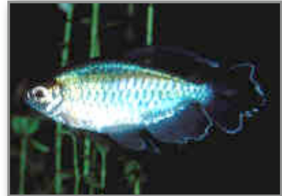
Phenacogrammus interruptus (Boulenger 1899)

A hodge-podge approach to stocking ones aquarium system is to be guarded against... These "garden variety" mixes of supposed "community" organisms rarely work out satisfactorily... With unneeded tension, extra maintenance and poor showing, growth and behavior of specimens as consequence of slipshod, inadequate investigation ahead of their acquisition. Do be a conscientious consumer and look into the needs and compatibility of the life you intend to keep before buying it. To the extent that you know what you're doing, so much more will be your enjoyment and understanding of your aquarium world.