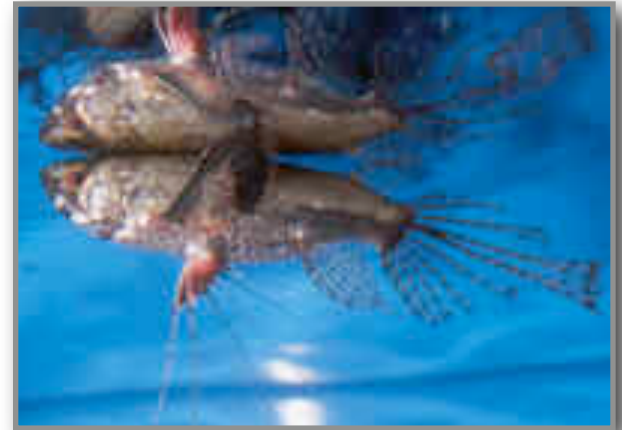
Pantodon buchholzi Peters 1877

Most folks will be finding themselves already in a "fixed" position of having a set-up in hand, or at least the principal components. Given this perspective, or starting point, you can work out what you might want to keep in a few ways... My favorite approach involves building a collection around a "must have" organism... Something that I really want to keep... and working from there in making sure the conditions that my "number one" piece