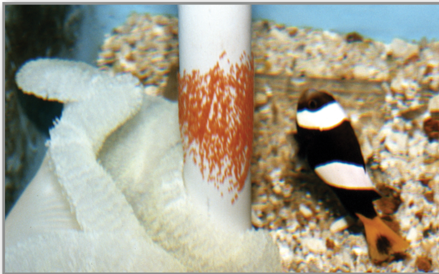
Figure 1: Parental care in sebae clownfish

Parental care in clownfishes is well known, mouthing and fanning are the important behaviours apart from defending eggs from predators. They fan the egg mass using pectoral and caudal fins and thus provide necessary water movement to the densely packed clutch and thus help in faster