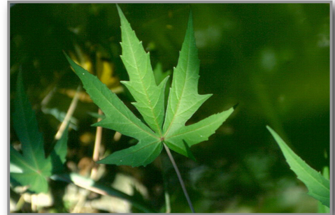
Hibiscus coccineus leaf

Iris (Iridaceae) . Hundreds are the species and varieties of Iris , all the I. laevigata , Iris pseudoacorus and I. kaempferi are suitable for ponds where they live in 15-45 cm deep water. I. kaempferi comes from China and Japan, is a strong plant and during the winter can live in dry soil. The flowers, white, violet, pink appear in June. The plant produces many stolons but if you want to reproduce Iris by seeds you have to wait