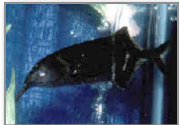
Gnathonemus petersii (Gunther 1832)

African or Freshwater Butterflyfish. A great favorite, and fabulous jumper... To four inches in length. Feeds on live crustaceans, insects and fishes.