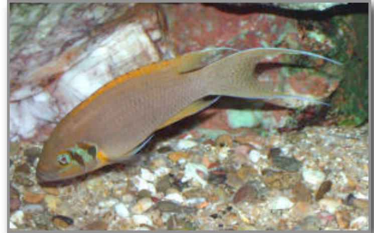
Neolamprologus pulcher "Daffodil"

This is one of the 'sardine cichlids' that form schools in open water, feeding on plankton. They rarely swim anywhere but at the top of the tank, making them useful for adding movement and colour to a community tank without overcrowding the hiding spaces among the rocks. They also work as excellent dither fish, encouraging shy benthic cichlids to leave their burrows or caves and swim about in the open. They are basically hardy, but like other open water fish require lots of swimming space so are not suitable for small aquaria. Maximum size is about 12 cm, with males being more colourful than the females. There are numerous varieties in the lake, some of which are regularly traded.