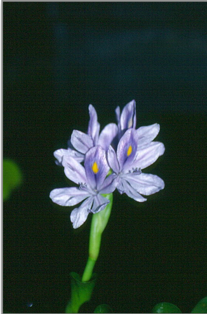
Eichornia crassipes flower

April. Remember: this plant doesn't like hard, alkaline water or earth and direct sunlight. Iris can grow up to 80 cm and are perfect for pond borders, planted in clumps.