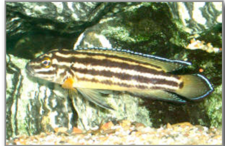
Julidochromis regani "Sumbu"

These facts should make it clear that both bodies of water are more like small seas than lakes, and it is because of this that they support such an incredibly variety of endemic species. As well as the cichlids for which the lakes are famous, they are also home to a variety of other aquatic animals including catfish, spiny eels, crabs, snails, even jellyfish.