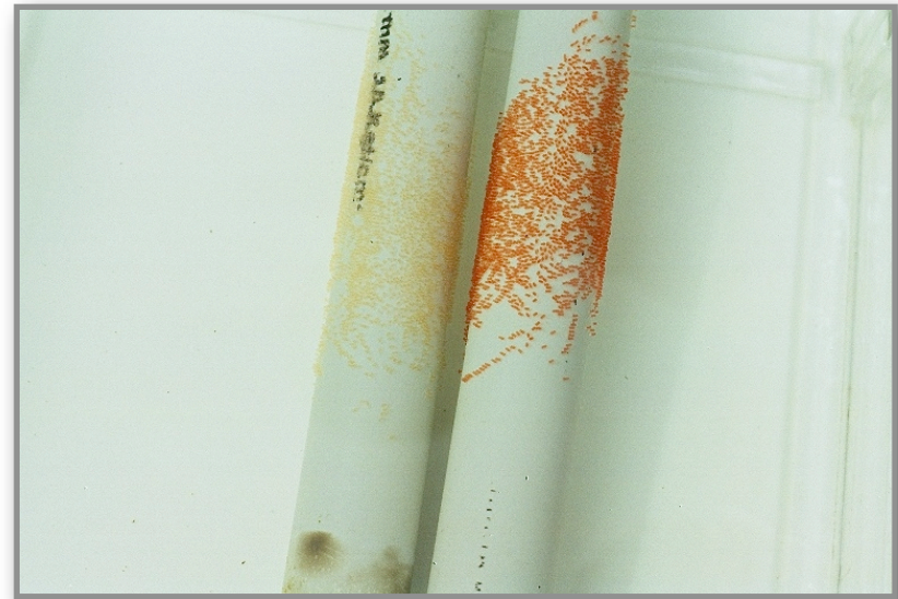
Figure 2: Sebae clownfish eggs on the PVC stand pipe

Brian D. Wisenden (1999). Alloparental care in fishes, Reviews in Fish Biology and Fisheries 9: 45-70.