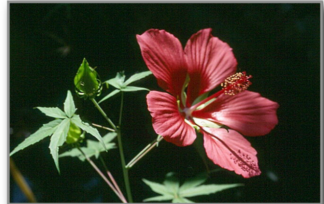
Hibiscus coccineus flower